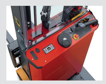
Lever and steering system