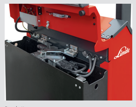
Easy battery access